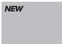
NEW CLEAR LACQUER FINISH