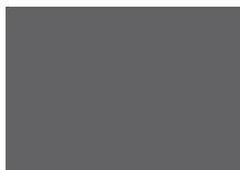
SILVER - TEXTURE GAK-MW333E