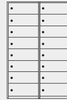
LAP11**D8 - NEST 2 16 Doors 16 Compartments H 1143mm Options W 225 X D 300 W 300 X D 375 W 375 X D 450 W 450 X D 450