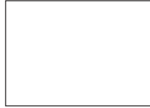
WHITE RAL 9003 GAK-MA585E