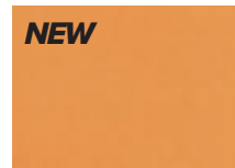
NEW JAFFA RAL 2003 *MOQ 20

Clear lacquer, BioCote antimicrobial coating not included.