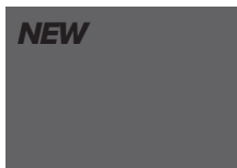
NEW GRAPHITE - TEXTURE GAK-MW333E