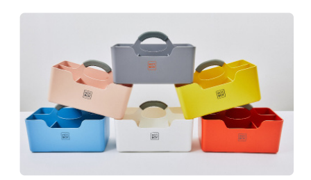
HOTBOX1 H 190mm W 312mm D 182mm

With Hotbox, the agile workplace flows. Hotbox is the vital link in the chain. For a seamless agile workplace, your people have to move quickly and easily around the space.