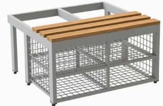
Locker stand with bench seat and mesh shoe shelf