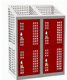
Perforated 2 tier, nest of 2 Locker with doors and sloping top