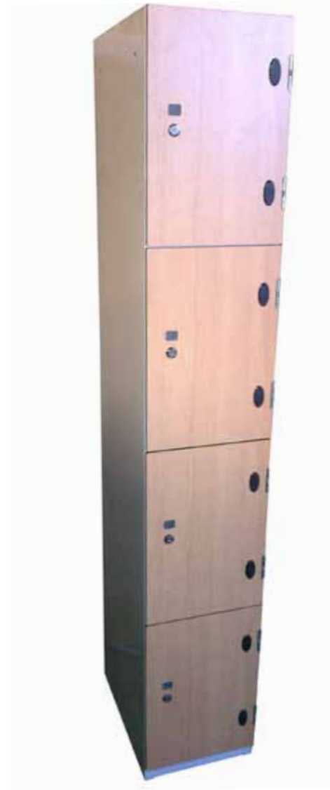
Image is of a 4 Tier sloping top Supreme locker with wet area cam locks.

All Supreme lockers are manufactured from 1.5mm thick aluminium with Solid Grade Laminate doors. The doors can be either Plant On or Inset and are available in a wide range of colours from the Arpa, Formica, Greenlam or Poly Ray 10mm SGL colours.